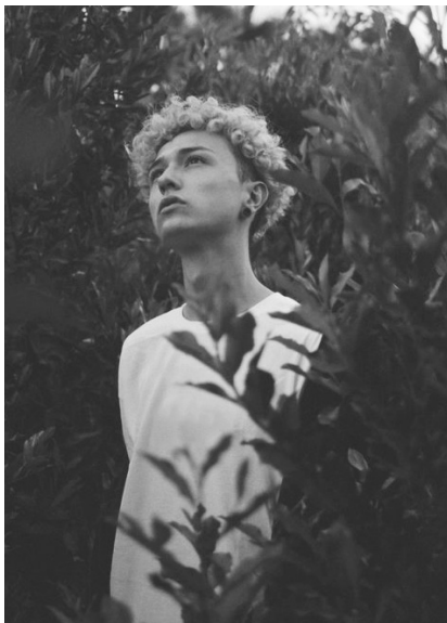
2015-16, Varied Dimensions Pigment Prints

Lopez's assemblages incorporate a range of lens based media from polaroids and 35mm analogue film to digital imagery. The quiet gestures in his scenes consider the locus of place and vestiges of memory.