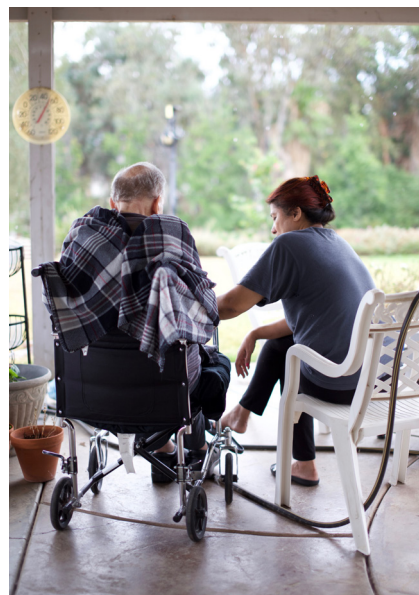
2016, 11 x 17" | Pigment Print