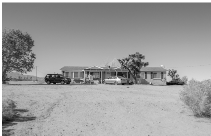
2016, 20 x 16" | Pigment Print

Inspired by photographers from the New Topographics movement, Ledoux's use of negative space and lack of color in High Desert 2015 embody the desolation of living in the California high desert.