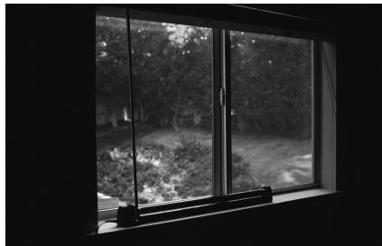
2015-16, Varied Dimensions Pigment Prints