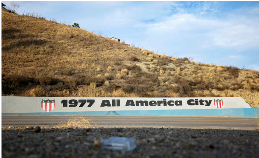
2015, 24 x 18" | Pigment Print

Surveying the post-industrial landscape of her hometown of San Bernardino, Cherry photographs forgotten and neglected parts of the city that speak to the economic downturn which residents have struggled to endure.