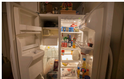
2016, 19 x 13" | Pigment Print