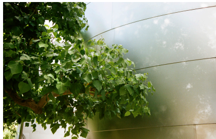
2015-16, Varied Dimensions Pigment Prints