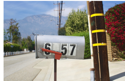
2016, 14 x 11" | Pigment Print

Observing her surroundings while carefully considering design and composition, Contreras shows traces of bygone California.