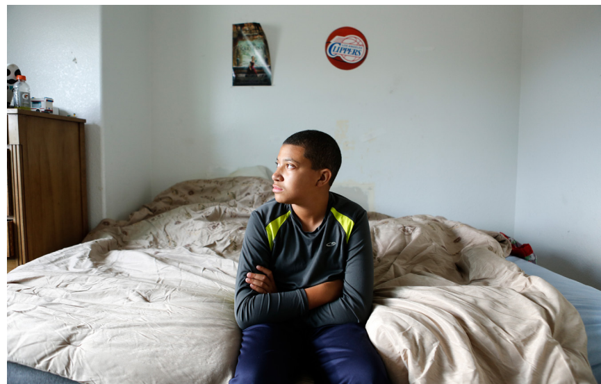
2016, 24 x 18" | Pigment Print