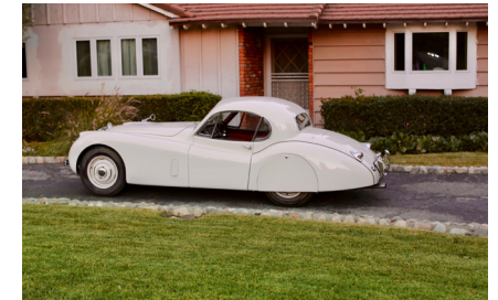
2016, 14 x 11" | Pigment Print