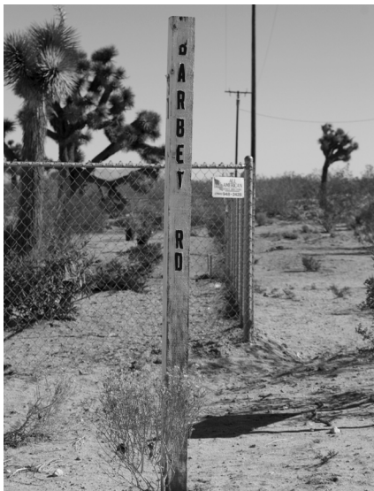
2016, 16 x 20" | Pigment Print

Historically, the dramatic backdrop of the American West has been explored by many photographers, but a deeper meaning surfaces when the places that are photographed are a part of one's day to day life.