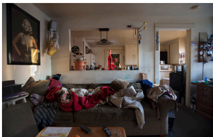
2016, 19 x 13" | Pigment Print